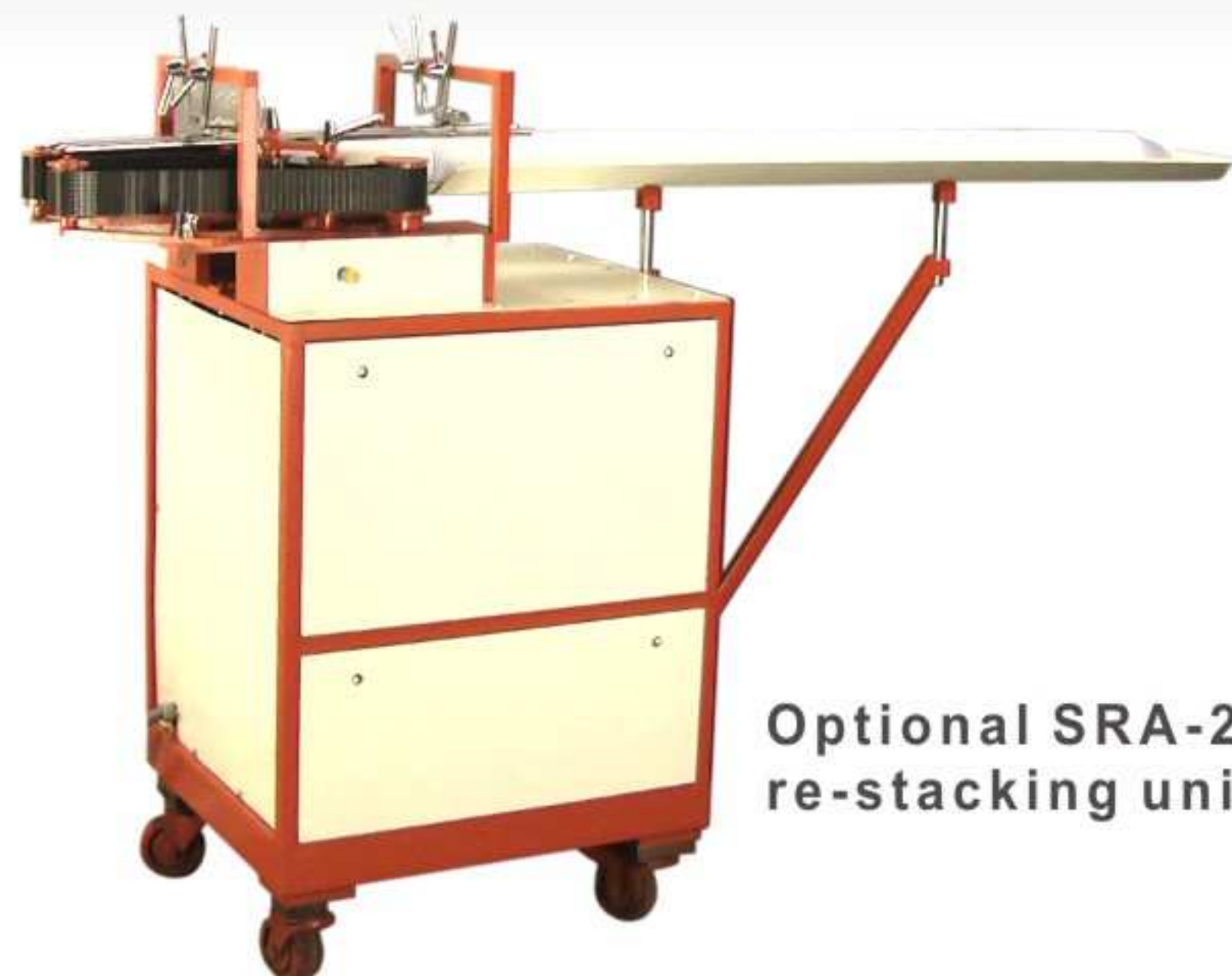
Optional SRA-250 re-stacking unit

The Signature Series upgrade is available for this press providing complete automation that includes a stack buffer for automatic stack feeding into the press and a re-stacking system with cup counting and stack segmenting.